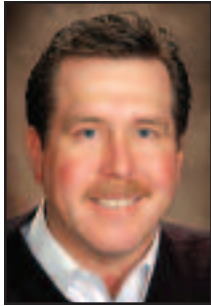
by Craig Eccher

AS WE ENTER the new year, it seems natural to look ahead to the future.