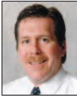
by Craig Eccher

W ith spring just around the corner, it seems like a fitting time to talk about some changes taking place at Tri-County.